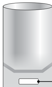
Handle Seal *Protects Hands